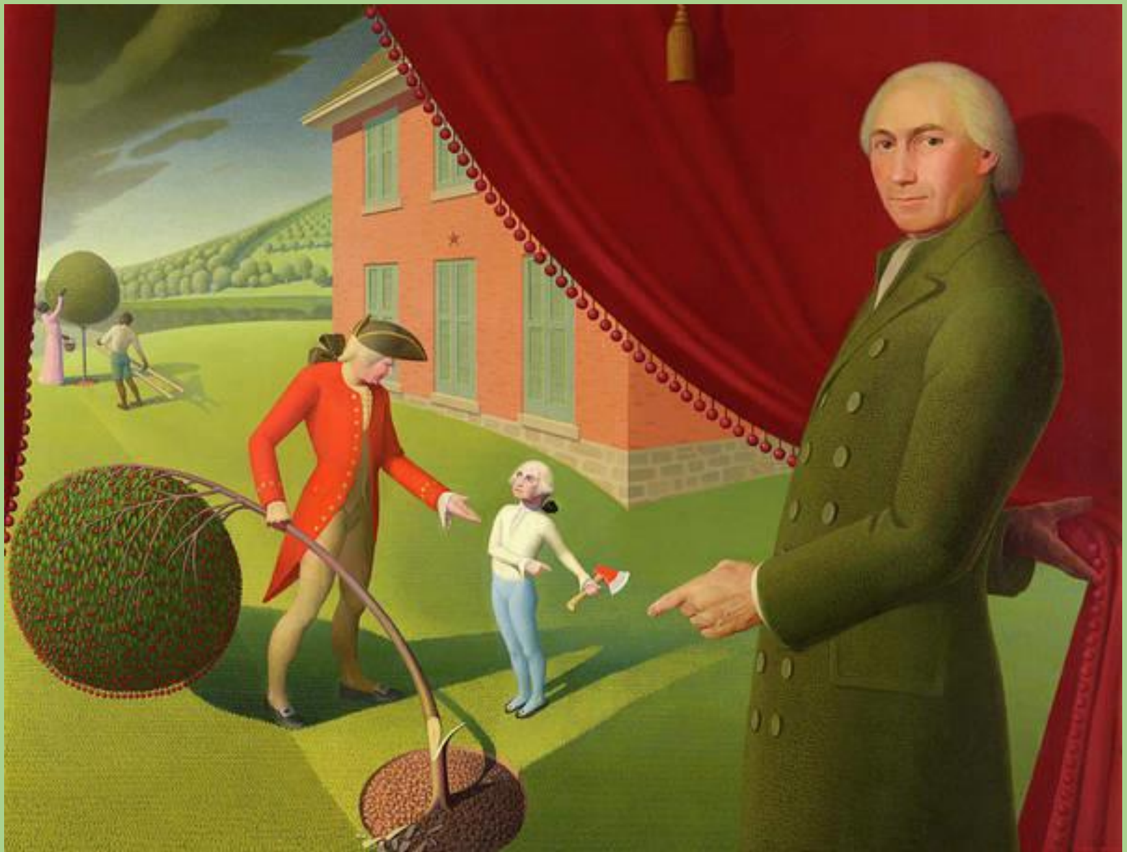
Parson Weems' Fable, By Grant Woods Wikimedia Commons